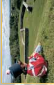
Fort No. 1, Lévis