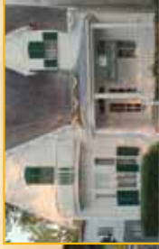
Maison Alphonse-Desjardins, Lévis