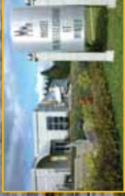
Musée minéralogique et minier Theford Mines